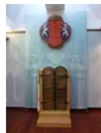
The Ark of the Great Synagogue of Vilna, Lithuania