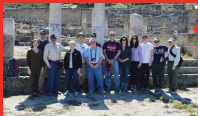
March 9-17, 2016, Rhodes, Greece Study Abroad spring break with students and community group.