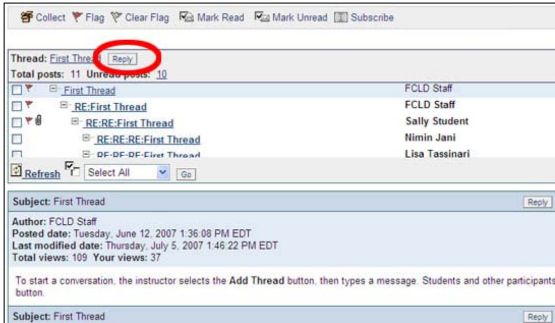
The Discussion Board Reply Button

The Discussion Tool is the tool most widely used in Groups. To enter the Discussion Board, click on the link that says Group Discussion Board . You will now see the Discussion Board(s).