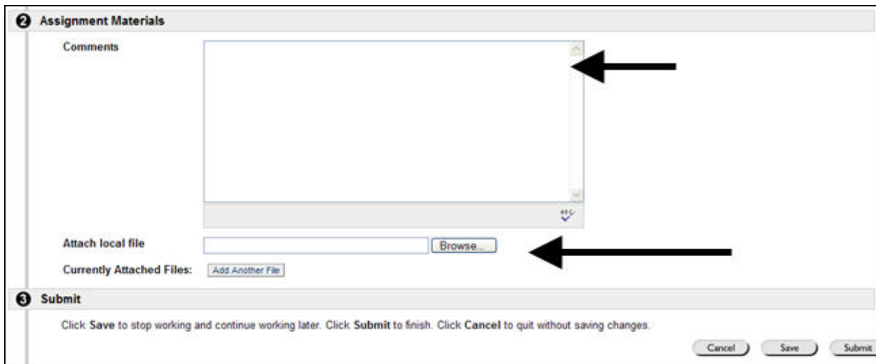
Submitting an assignment

Tips for using Assignment Tool successfully: